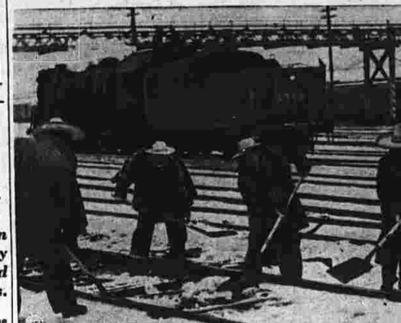
Wearing straw sombrero and colorful serapes, these newly-arrived Mexican laborers see their first snow as they clear snow from switches in the New Haven yards of the New York, New Haven and Hartford railroad.